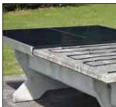
First step of renewal: one new Renewal Top is fitted