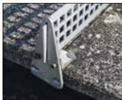
Rough, uneven playing surface of an old concrete table tennis table